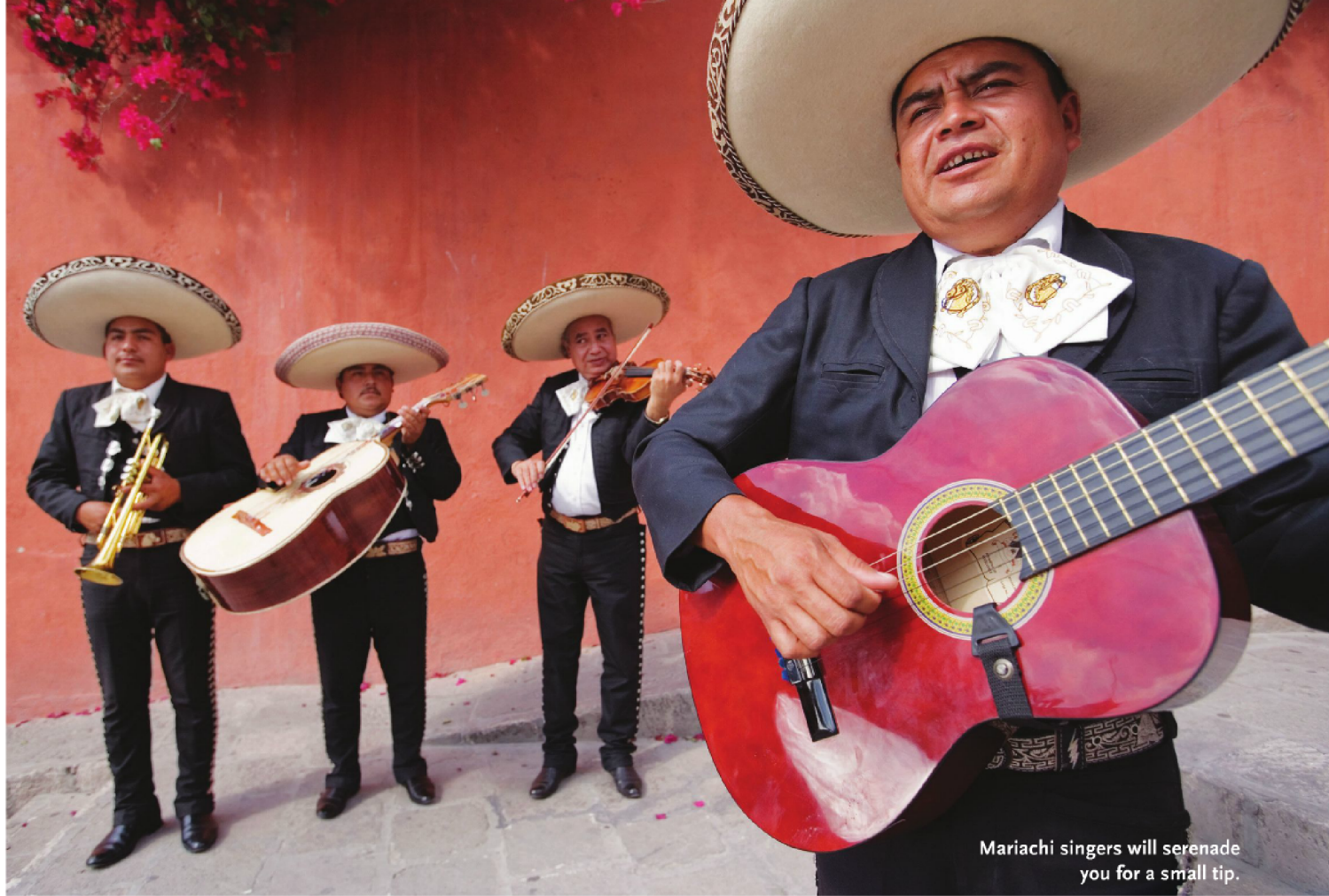
Mariachi singers will serenade you for a small tip.